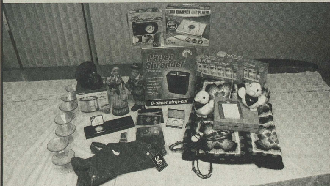
RMC Employee Volunteers have started to collect Silent and Live Auction Items.

The Harvest Ball will include a social hour, prime rib dinner, drinks, live auction and silent auction followed by a dance with live music by "Tin Star."